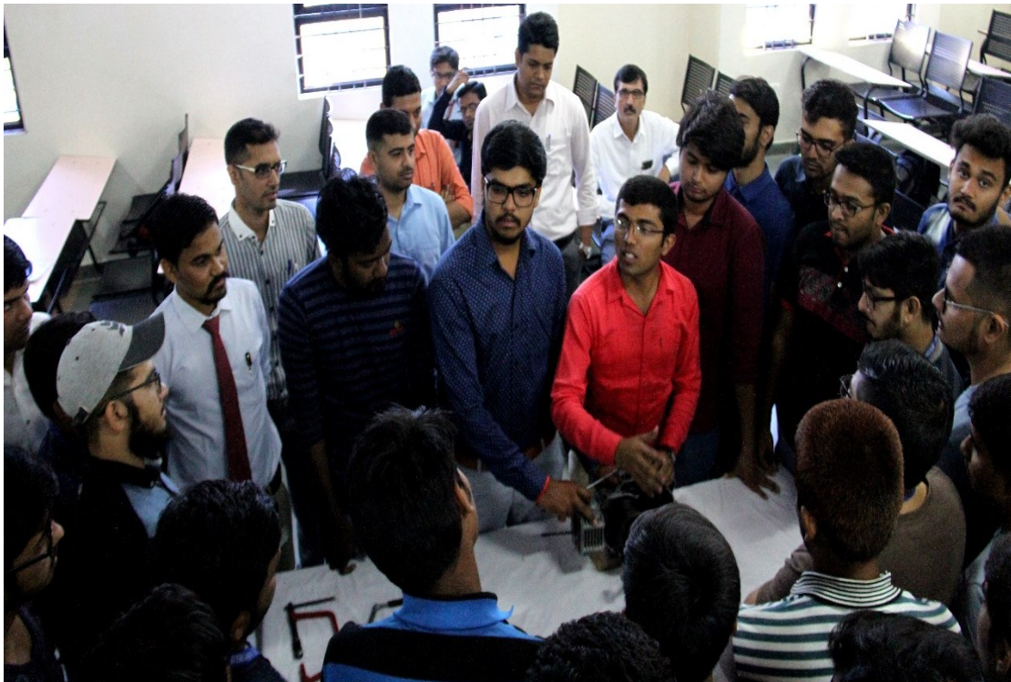
Engine Components Explanations by expert