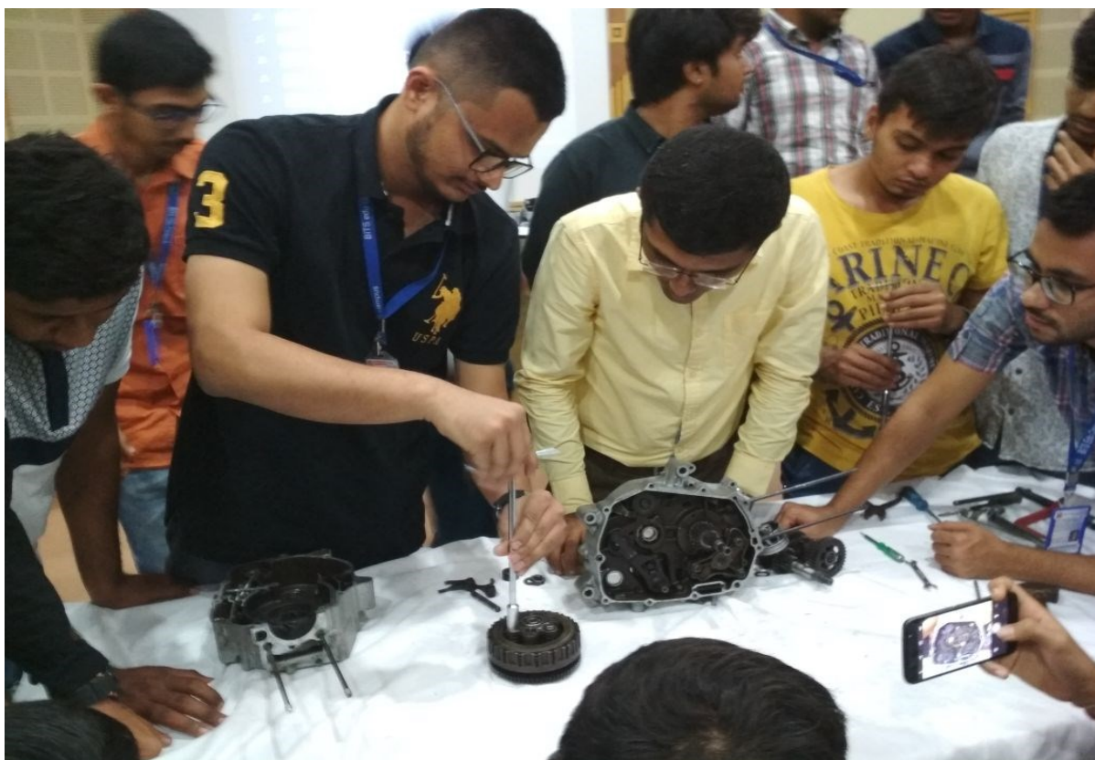
Assembling of Engine by students