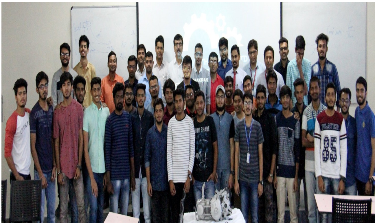
Group photo of students with faculties and Experts.