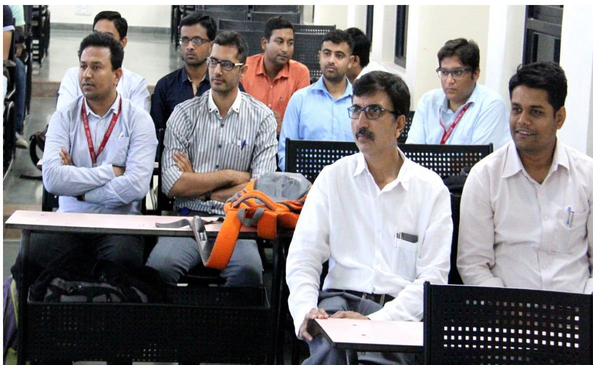
Faculty members attending the session