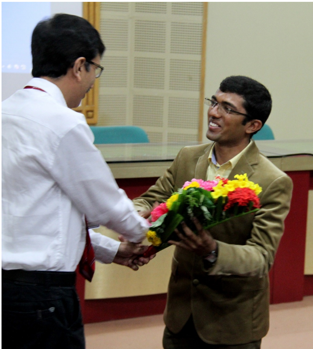
Welcoming of the Expert by Head of the Department

The following are few glimpse of the event: